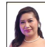
Soci Ame Patagani-Viking Community Service